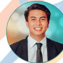
ACE TIMTIM Club Young Leader's Contact / Sgt. at Arms