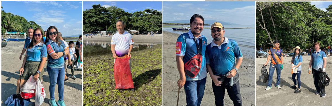
09212024 - the Rotary Club of Dumaguete North joins the Area 3D Coastal Cleanup activity held at Silliman Beach. The project was participated by the different Rotary Clubs and Rotaract Clubs in Dumaguete City, in celebration of the International Coastal Cleanup Day 2024.